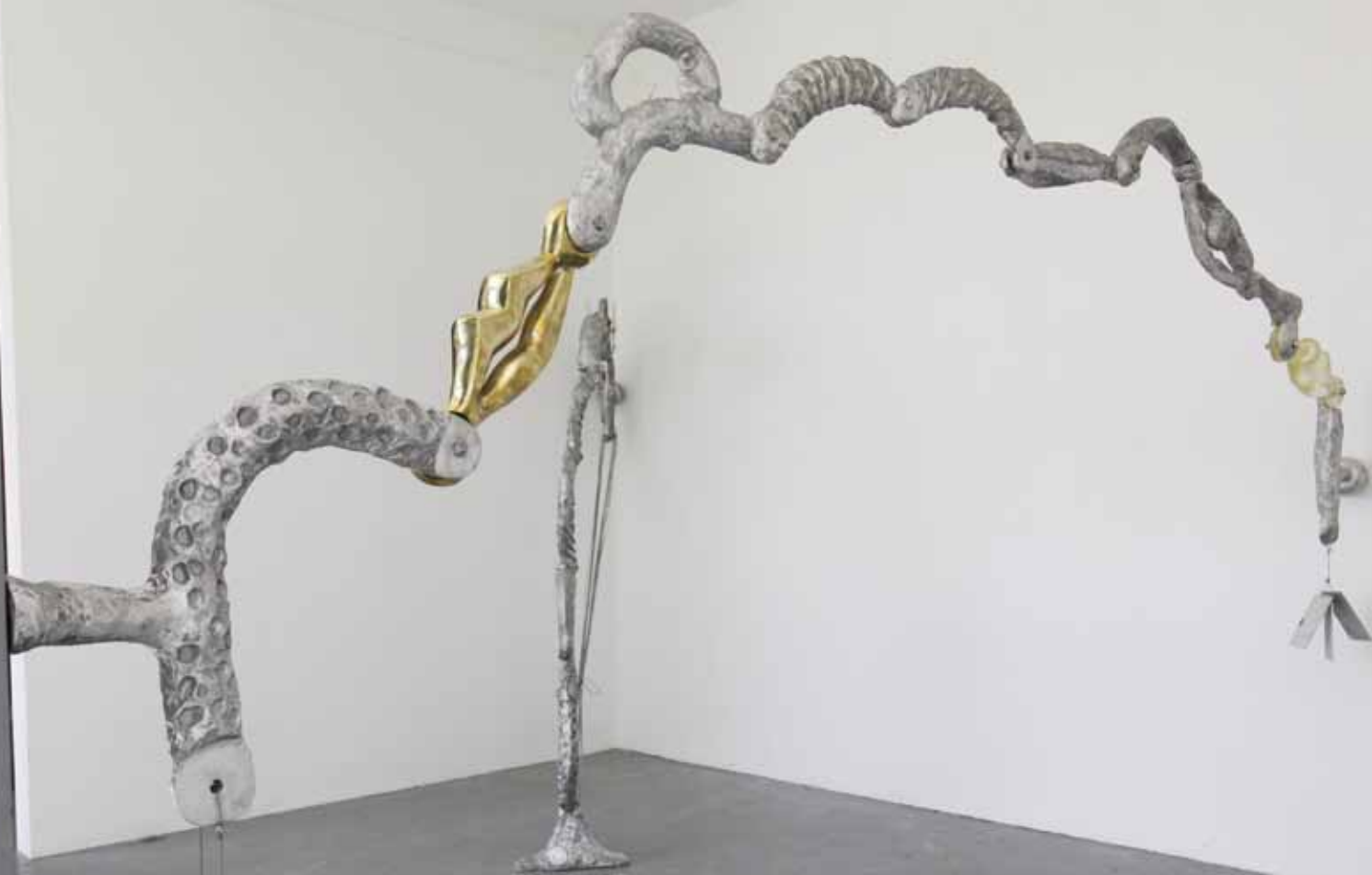
Bez naziva, liveni aluminijum, livena bronza, liveni epoksid, sajla, šrafovi, 482 x 150 x 35 cm, tež. 65 kg. 2012god.