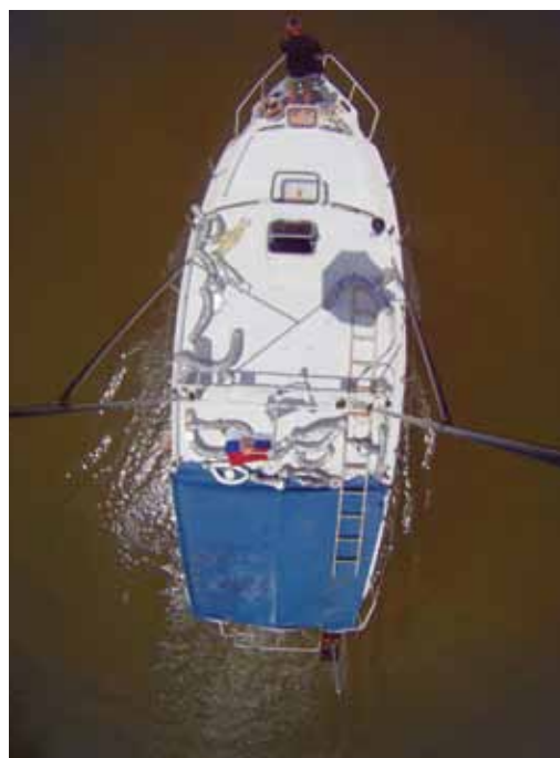
Kadar iz video rada Veljka Pavlovića