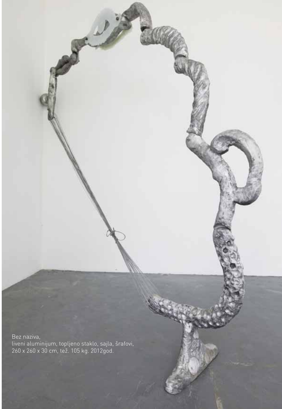
Bez naziva, liveni aluminijum, topljeno staklo, sajla, šrafovi, 260 x 260 x 30 cm, tež. 105 kg. 2012god.