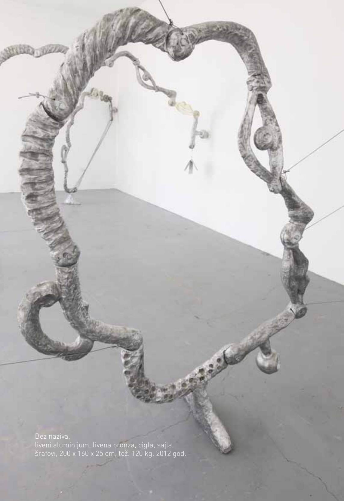
Bez naziva, liveni aluminijum, livena bronza, cigla, sajla, šrafovi, 200 x 160 x 25 cm, tež. 120 kg. 2012 god.